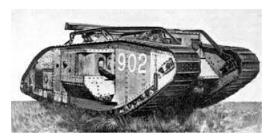
Object : Tank